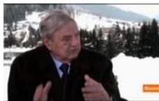
Soros: I Expect More Volatility in Europe Q