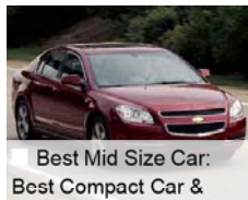
Best Mid Size Car: Best Compact Car &