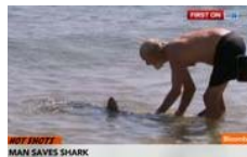
Man Drags Shark Away From Beachgoers in Australia Q