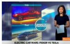
Electric Car Wars: Fisker Struggles, Tesla Ramps Up Q