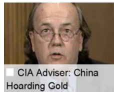
CIA Adviser: China Hoarding Gold