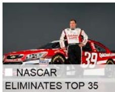
NASCAR ELIMINATES TOP 35