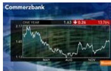
Commerzbank Plans to Cut 4,000-6,000 Jobs by 2016 Q